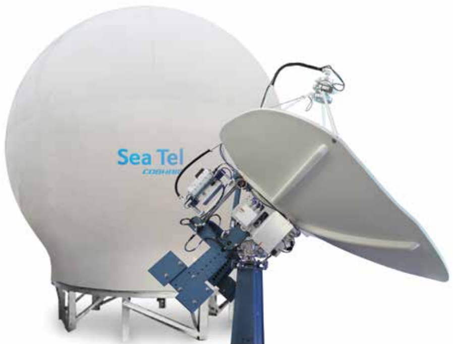
Sea Tel 9711 with Ku-band feed.